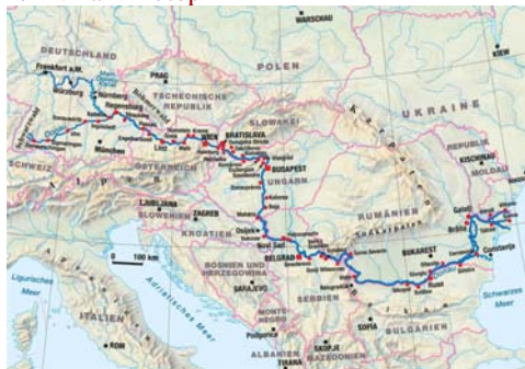
Figure 1: Danube river map

<EN-narr>Relevant documents should contain at least a short description of cities through which the rivers Danube and Rhine pass, providing evidence for it. The Danube flows through nine countries (Germany, Austria, Slovakia, Hungary, Croatia, Serbia, Bulgaria, Romania, and Ukraine). Countries along the Rhine are Liechtenstein, Austria, Germany, France, the Netherlands and Switzerland</EN-narr> </top>